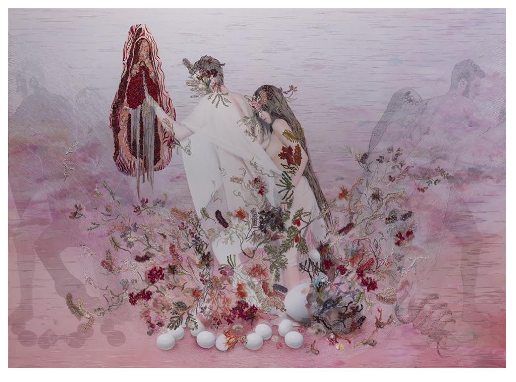
Asami KIYOKAWA | Mythology - Kigen (origin) | 2019 | Canvas, embroidery thread | 1818 x 2518 x 39mm