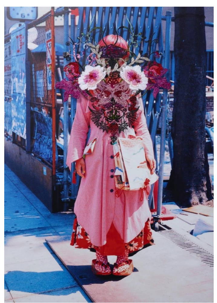
Asami KIYOKAWA | Tokyo\ Monster - Scarlet | 2018 | Photograph, embroidery thread, beads | 84(h) \times 63(w) \times 4.8(d) cm