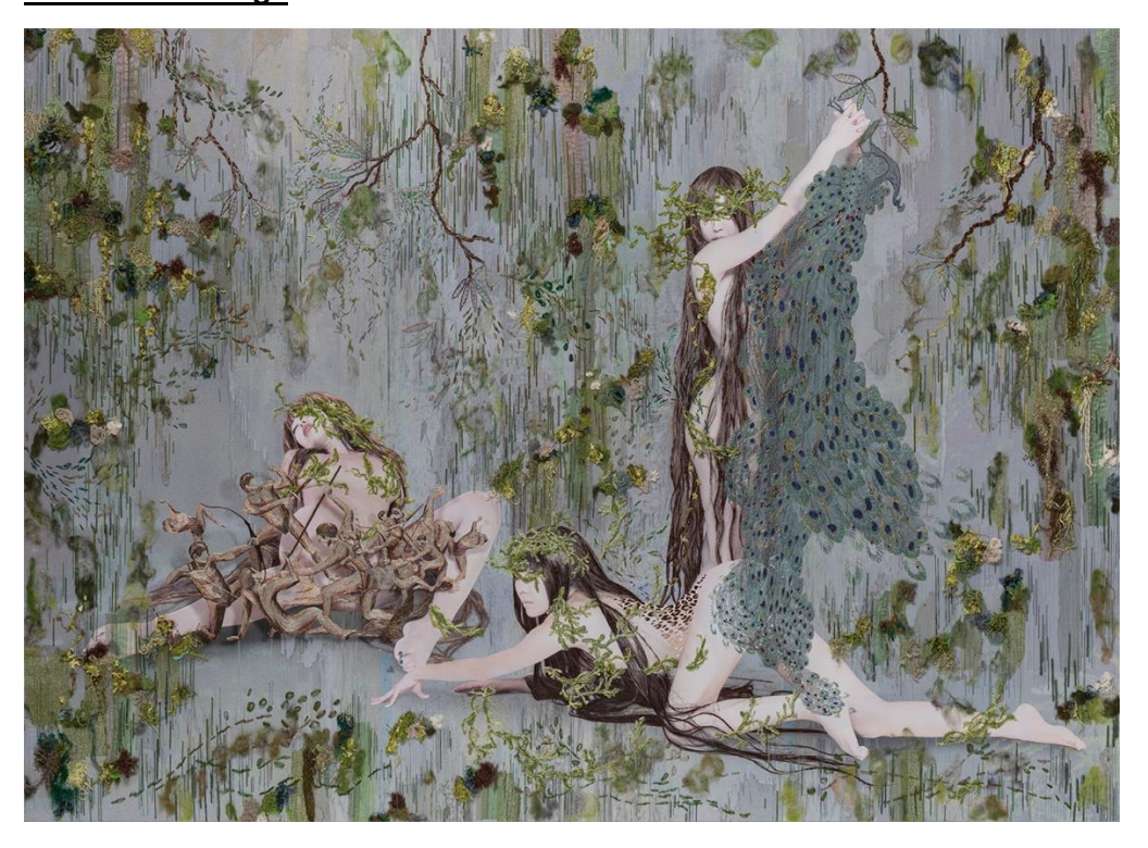
Asami KIYOKAWA | Mythology - Bishin (graces) | 2019 | Canvas, embroidery thread | 1818 x 2518 x 39mm © The Artist and ARARIO GALLERY