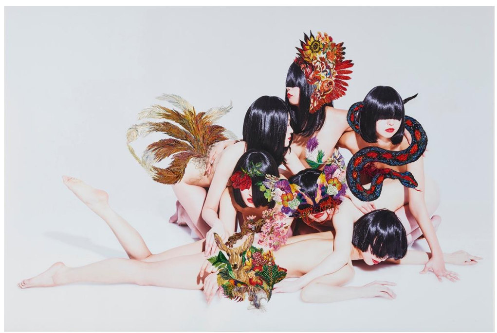
Asami KIYOKAWA | Mutant - Animal Version | 2018 | Photograph, embroidery thread | 1,026 x 1,535 x 51 mm