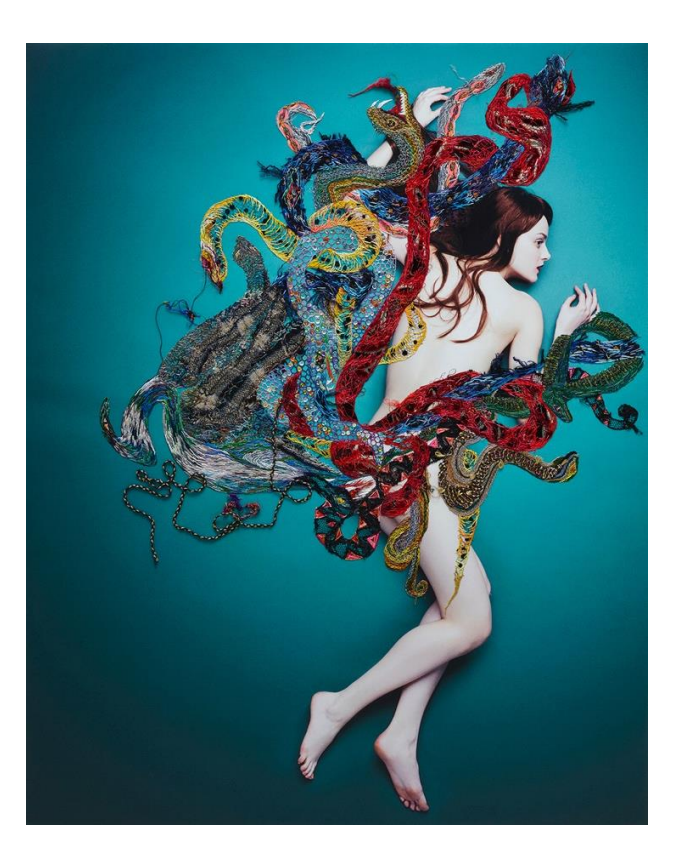
Asami KIYOKAWA | Complex – Dreamer | 2018 | Photograph, embroidery thread, beads | 990x1,205x60mm