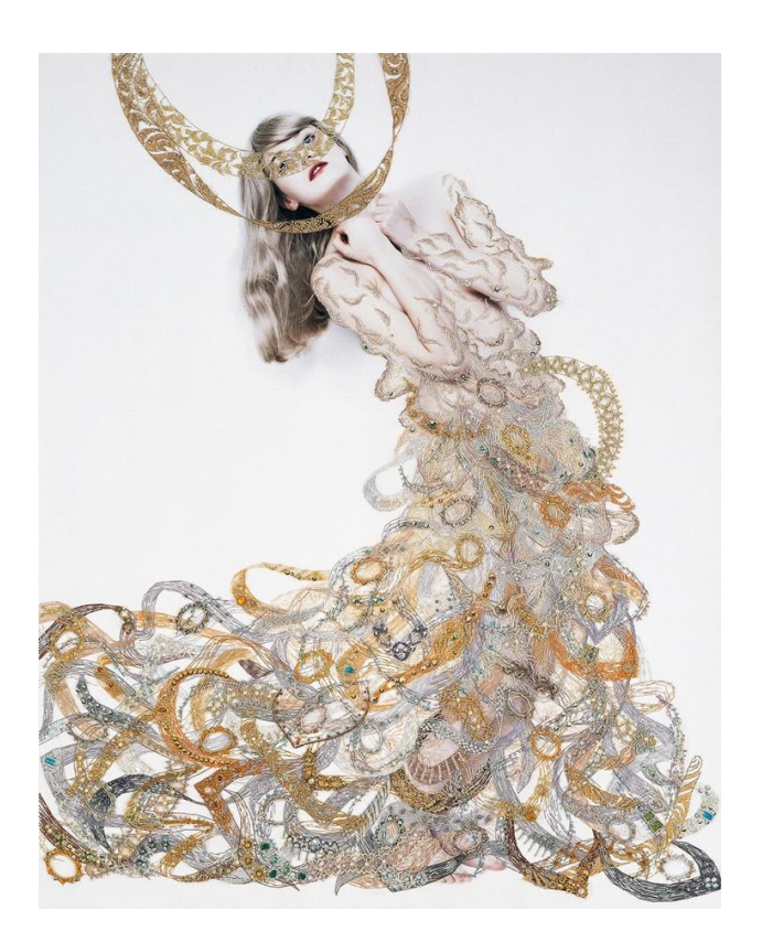
Asami KIYOKAWA | Complex - Marriage | 2018 | Photograph, embroidery thread, beads | 990x1,205x60mm © The Artist and ARARIO GALLERY